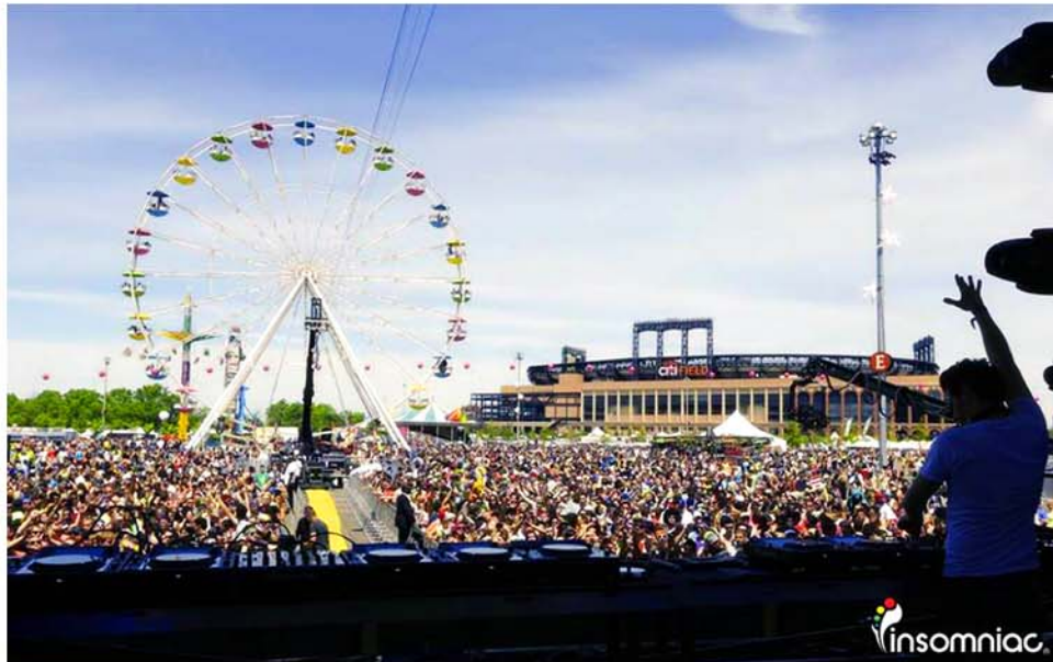
Image sources: http://partyinfo.si/prenosi-v-zivo/electric-daisy-carnival-new-york and http://www.nytimes.com/2013/05/20/arts/music/electric-daisy-carnival-at-citi-field.html?_r=0