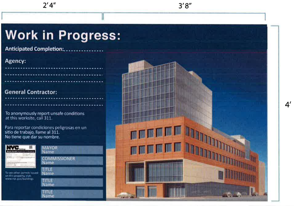
FIGURE 2 FENCE PROJECT INFORMATION PANEL LAYOUT